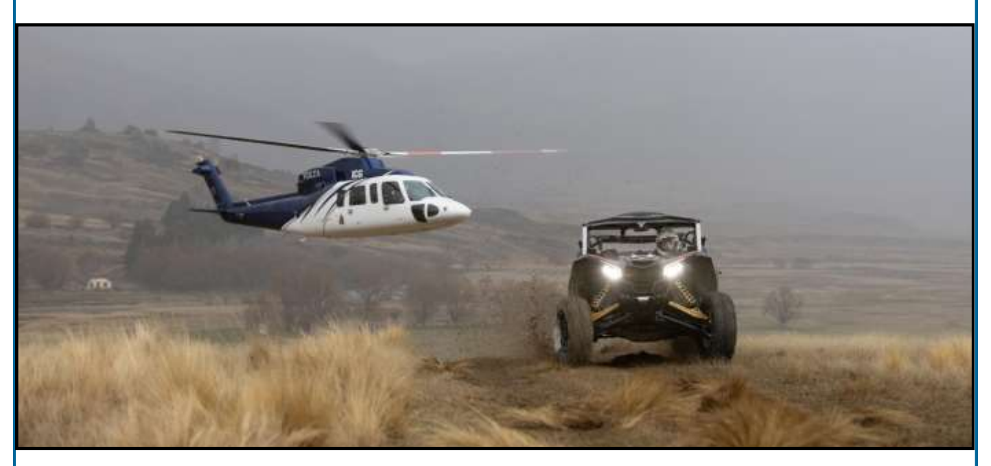
The Sikorsky delivers tourists for off road vehicle experience in the South Island High Country.