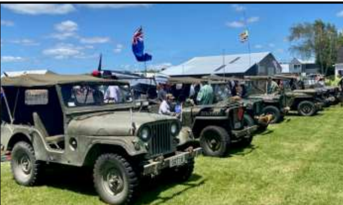
There were plenty of wartime vehicles on show.