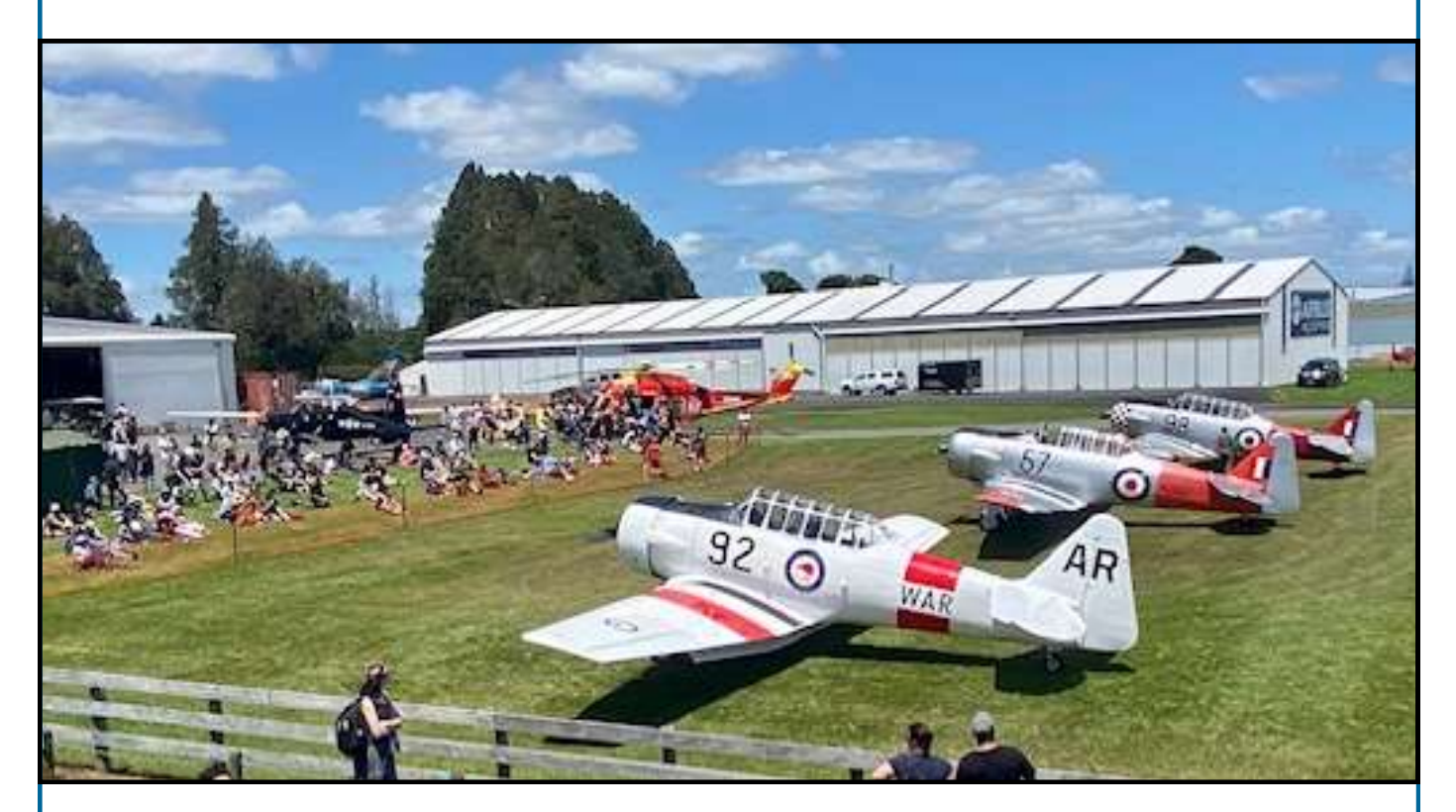
Spectators of all ages were able to keep an eye on a wide range of aircraft on display.